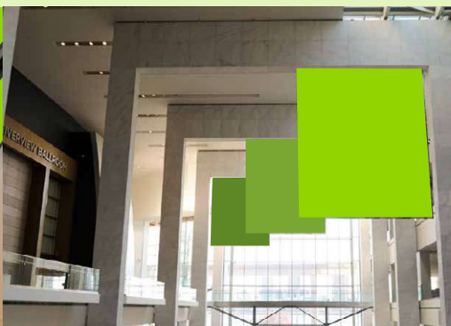
Atrium Ceiling (3 hanging double-sided banners)